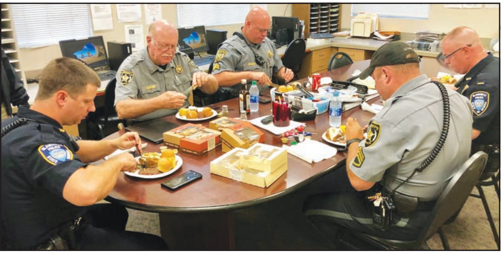
Union County Sheriff's deputies and Blairsville Police officers breaking bread during their WoodmenLife-sponsored appreciation lunch last week.