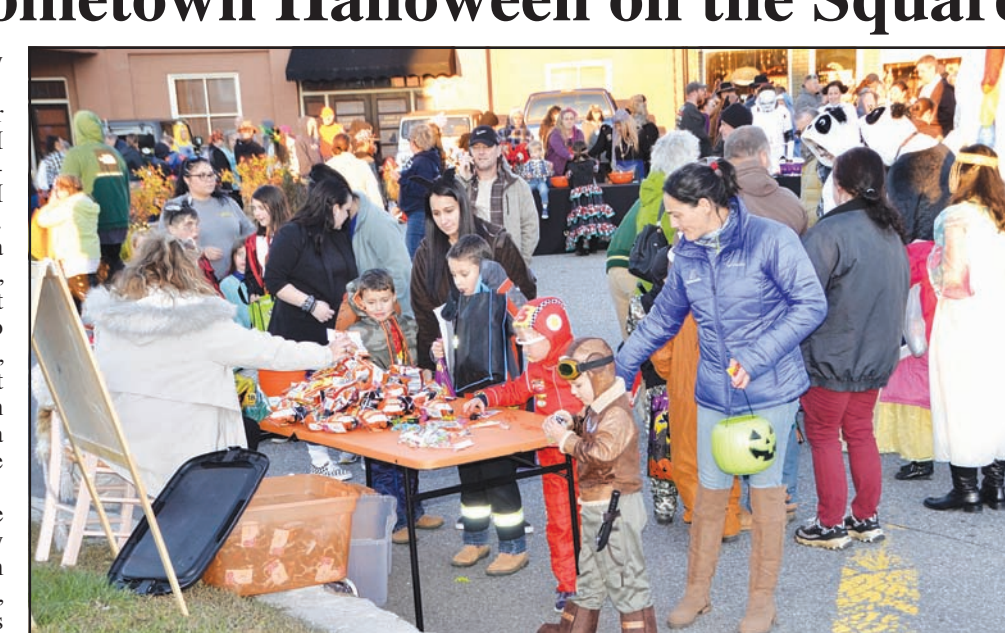
Hundreds and hundreds of costumed children flocked to the Blairsville Square to trick or treat for Hometown Halloween on Nov. 2.