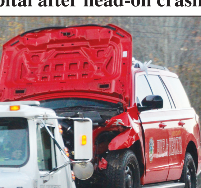
The Fire Department's Ford Expedition being transported from the scene of a Nov. 1 crash on Murphy Highway.